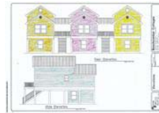
The Beachcomber Cottages at Corpus Christi Beach.