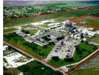
Hoechst-Celanese Technical Center will become the Clarkwood Industrial Park.