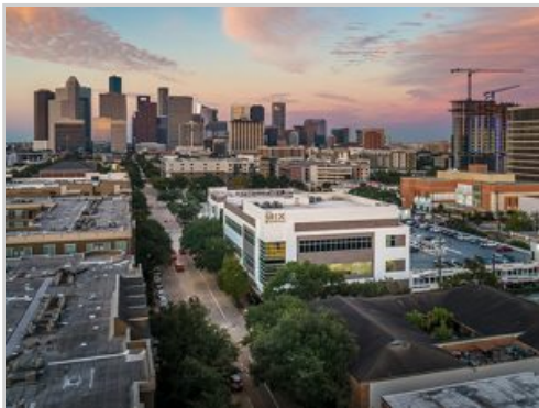
JLL Negotiates Sale of 73,000 SF The Mix @ Midtown Retail Center in Houston

Retail, Office Trends Influence Apartment Development Strategies, Says InterFace Panel