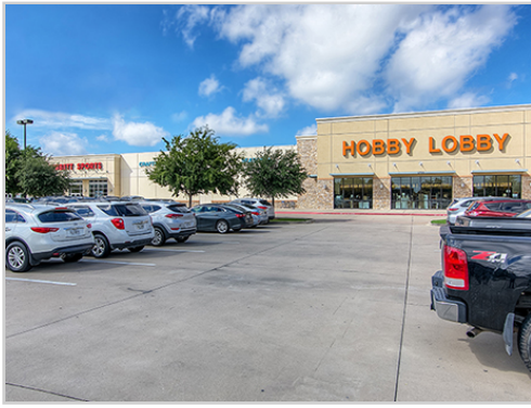
JLL Negotiates Sale of 150,007 SF Little Elm Towne Crossing in Frisco