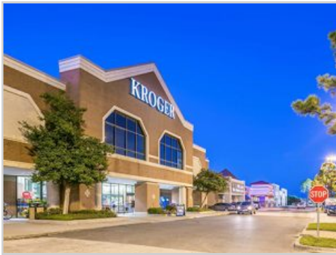
JLL Negotiates Sale of 173,344 SF Kroger-Anchored Shopping Center in Metro Houston