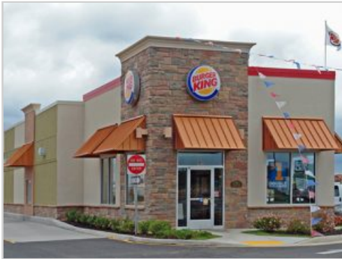
Spirit Realty Capital Acquires 123 Single-Tenant Retail Properties from Service Properties Trust for $435M